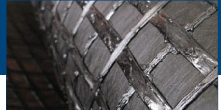
Mirafi® FG Paving Grid

The high crossover junction bond strength improves structural integrity of a new overlay. A polyester scrim attached to the paving grid bonds to the old pavement and is tacked with liquid asphalt to provide adhesion of the paving grid during construction of the hot mix overlay.